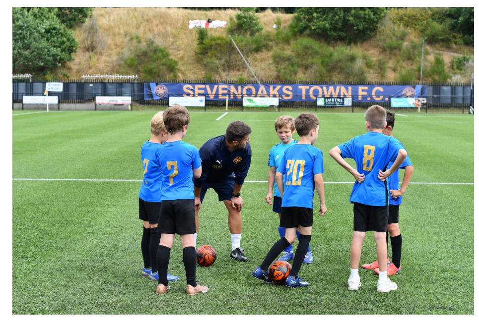
Sevenoaks Town Official Programme 2024-25 - Page 23