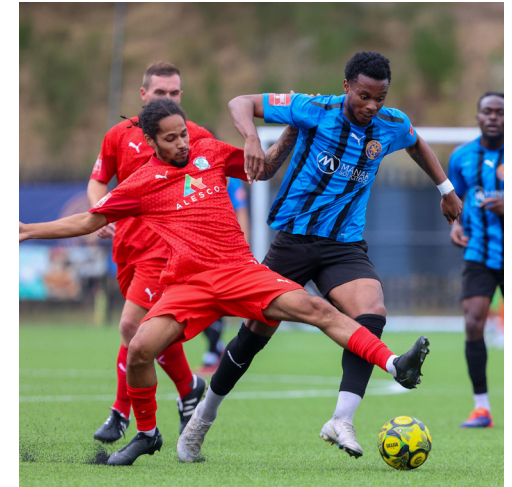
Action from the first of our trilogy with Beckenham